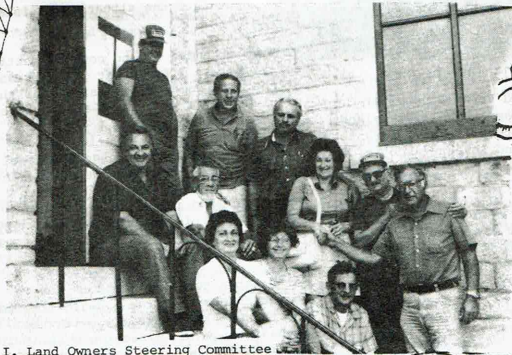
K.I. Land Owners Steering Committee