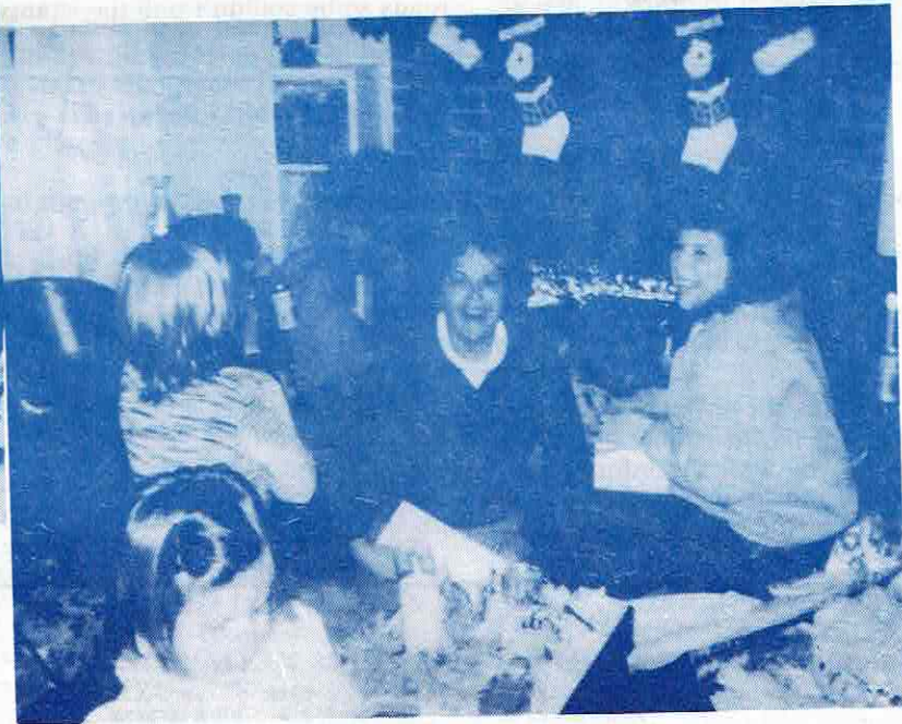
lay, and adults with the happening were: RTY REED, JERRY Christmas day) and