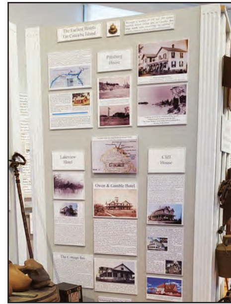
"Era of Catawba's Grand Hotels" display coming to Union Chapel Museum of Catawba Island Historical

The museum is located in the iconic 1888 Union Chapel on E. Porter Street at the north end of Catawba Island. It began its annual May to October operation in 2018. A year earlier, however, the Historical Society started a series of speakers about historical subjects. Examples have ranged from the lives and customs of local Native Americans... to this area's response to Prohibition... to the geology of Lake Erie's Western Basin. A speaker is planned for Wednesday, June 3, 2020 with the topic to be announced in the spring.