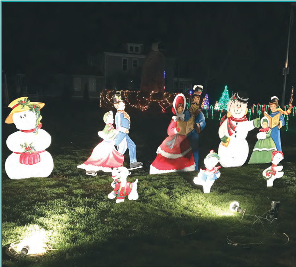
Memorial Park Christmas Lights