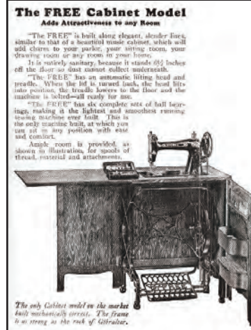
Free No. 5 Treadle Sewing Machine

Advertisements for the period show a similar version of this full cabinet model. This one is likely pretty rare. Our thanks to Diane Nickles for this donation.