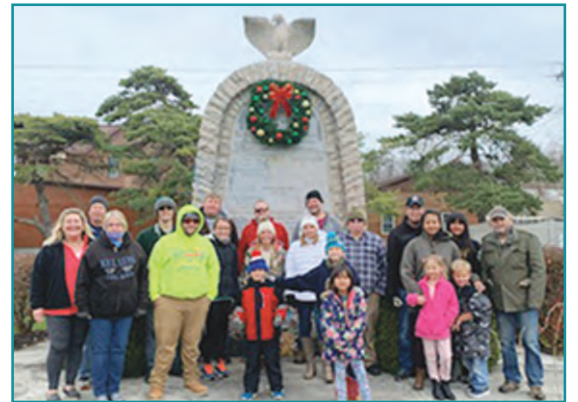
Christmas Light Decorating Crew