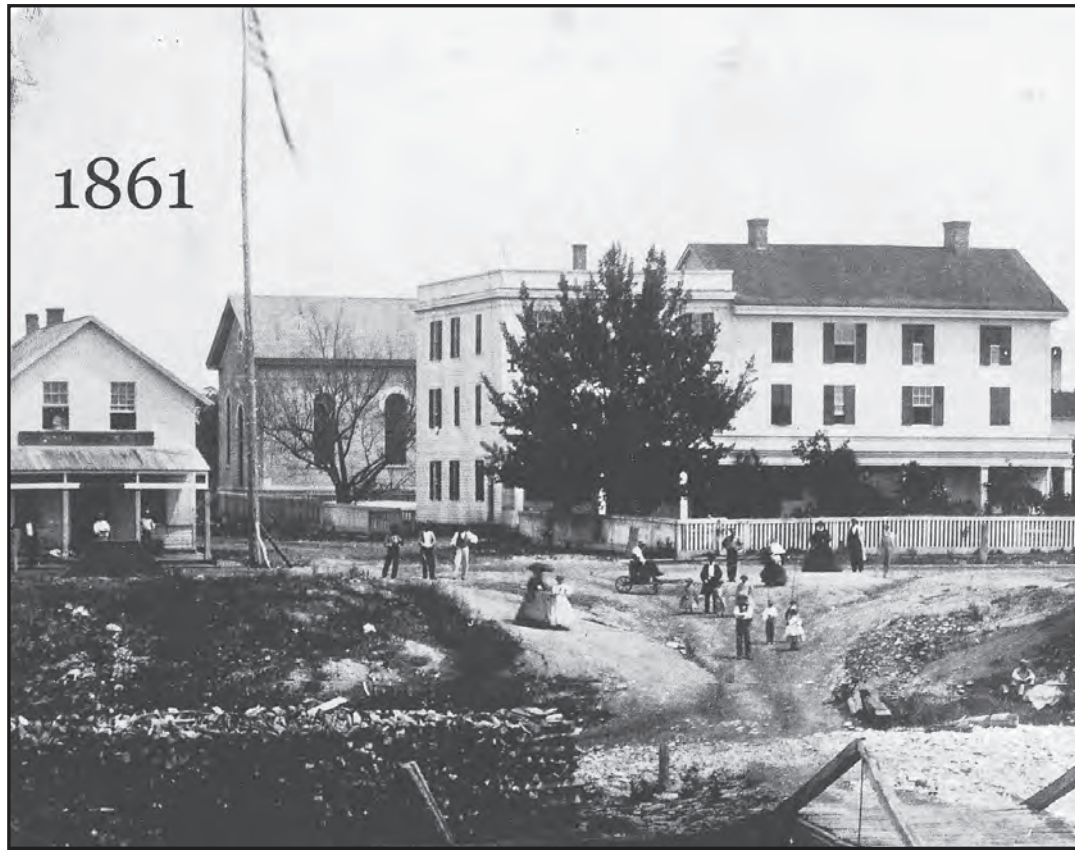
The Store on the Corner

time to see the bridal party drive up to the gate in a two horse vehicle. Couldn't say positively how many there were in it, but when they commenced spilling out, it put us in mind of the picture accompanying the old melody, which runs somewhat as follows, "There was an old woman that lived in a shoe (we will not repeat the remaining lines as they are doubtless familiar to most of our readers).