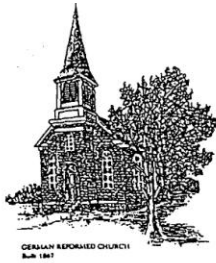
GERMAN REFORMED CHURCH EST. 1847