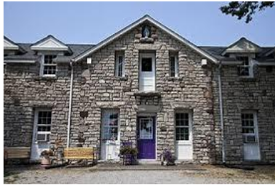
Vi's Island Treasures 419-746-2268 http://www.kelleysislandchamber.com/place/vis-island-treasures/