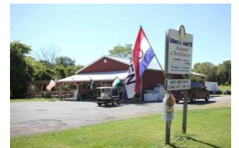
Unc'l Dik's 833 Division St. http://www.kelleysislandchamber.com/place/uncls-diks/