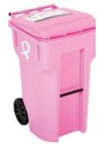
Lake Disposal Services of Northern Ohio http://lakedisposal.com/index.html 877-582-6800 LakeDisposal@yahoo.com