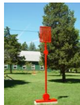
The Charles Herndon Galleries & Sculpture Gardens www.charlesherndon.com 419 746-2249