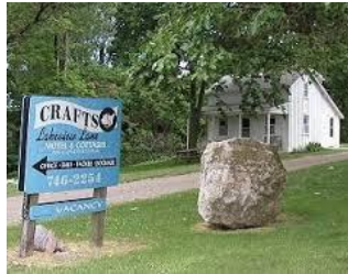
Crafts Lakeview Lane cottages, motel & bait shop Email: KelleysIsland@cros.net http://www.kelleysisland.com/properties/crafts-lakeview-lane/