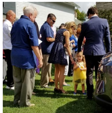
(L) And finally, our September couple. The groom had a heart transplant and in honor of the person who saved his life, they lit a red candle to remember the heart donor.

We have lots of (what are now considered 'vintage') photos of other weddings. Is your Island wedding photo on our page?