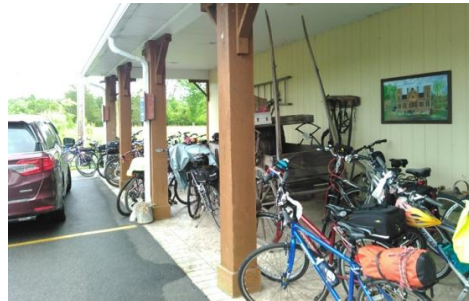
(L) This was a classic June wedding, with a twist. Everyone came in Hawaiian shirts and leis and rode bicycles.