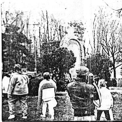
Daring contestant reaching egg on top of the monument with the help of a friend