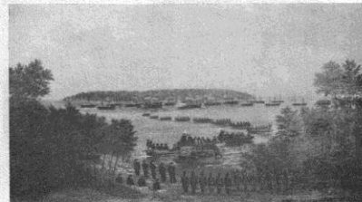
THE BURIAL OF THE AMERICAN AND BRITISH OFFICERS

[referring to the burial of the officers of both fleets on Put-in-Bay.]